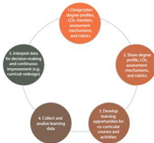
Figure 2. Cycle for Institutional Outcomes Assessment applied at UDLA (Adapted from Driscoll & Wood, UDLA’s Educational Model 2020)

Every semester, starting in 2015, all UDLA’s programs assess Learning Outcomes following the guidelines established in the Learning Outcomes Assessment Plan and Process. With the objective of identifying areas for improvement, these results and their analysis yield the program’s annual improvement plan. As of 2022, and as part of UDLA’s commitment to continuous improvement, the assessment cycle has been expanded to cover two academic periods.